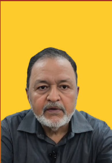
Cause ID - 25038 Thane, Maharashtra

May Allah (SWT) accept their charity, bless their wealth with barakah, and reward them abundantly in this world and the Hereafter. Ameen.